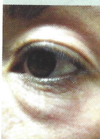
BEFORE using a leading brand