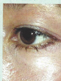
AFTER 6 weeks of Revival—Eyes